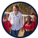
Build skills through fun