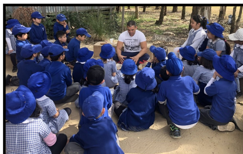
Aboriginal story time